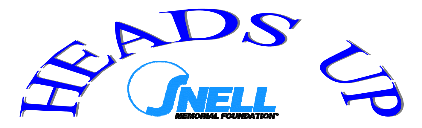
The Quarterly Newsletter of the Snell Memorial Foundation

This is the forty second of the Foundation's newsletters to the helmet manufacturing industry. The forty first was sent out in May 2005. Comments and items for inclusion in subsequent issues are invited.